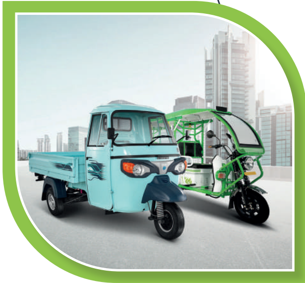
E-Rickshaw & E-Cargo