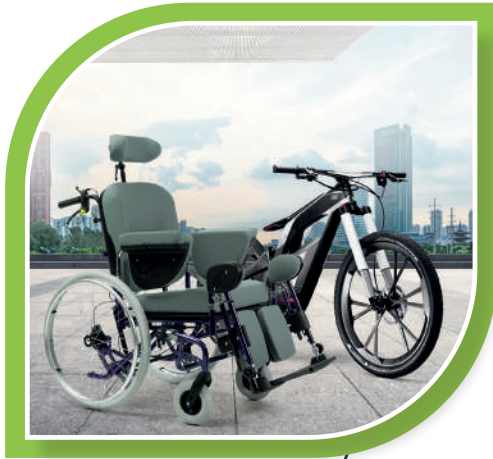
E-Wheelchair & E-Cycle