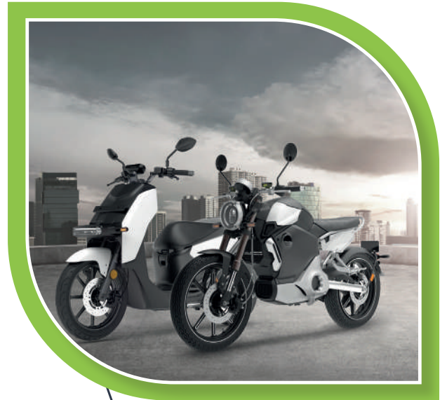
E-Bike & E-Scooter